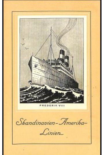
Menu and music program from the S. S. "Frederik VIII" for 1927

The Family Files are housed in a good, old-fashioned filing cabinet. At the moment the collection contains over 650 files on individuals or families from all over North America. The files can include almost anything on paper: documents, photographs, letters, memoirs, genealogies, clippings, or copies of the same. These items are kept in files because there is not enough material to require an archival box and a place among the boxed collections, though files sometimes grow into boxes. If we randomly pull out some of the files, we see interesting examples of what can be found within them.